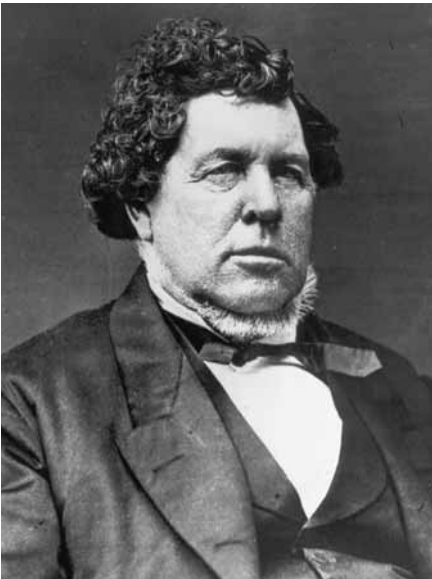
George A. Smith (1817–75) was a participant in Zion's Camp, a missionary, an Apostle, a counselor in the First Presidency of the Church, Church historian, and a member of the Utah legislature. He was a cousin of the Prophet Joseph Smith.

The Indian problem in southern Utah complicated these circumstances. The Saints had endeavored to cultivate good relationships with the Indians, but there was still danger. The Indians distinguished between the "Merocats" (any Americans traveling through Utah), whom they entirely distrusted, and the "Mormonee," whom they generally liked. The possibility existed, however, that the Indians would turn on the Mormon settlers. 13